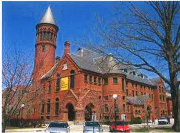
108 Crescent Street, Norwich, CT

Located on the campus of Norwich Free Academy, the Slater Museum awakens visitors to the richness and diversity of the human experience through art and history. For more than one hundred years, the Museum has displayed and interpreted the best examples of fine and decorative art, representing a broad range of world cultures. This is a gem with a large collection of plaster casts of ancient sculptures displayed in a beautifully preserved Richardsonian Romanesque building. Both interior and exterior are largely unchanged since construction in the 1880s. Especially impressive are the original wood columns, beams, and trusses along with the original wood paneled ceilings under a huge gable roof, a barrel vault, and a cone-topped tower. Charming, knowledgeable, and accommodating staff.